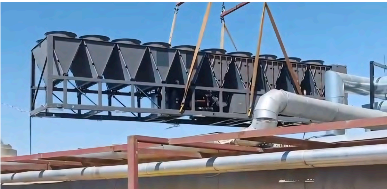
The team carefully installed the new chiller, completing mechanical, electrical, and network connections to integrate it into the hotel's chilled water system. It's inspiring to see such efficient and productive teamwork!