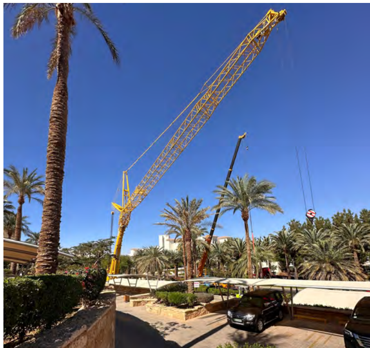
Planned and specialized crane operations were required to safely remove the resort's old system.

This project reflects the technical capabilities, planning, and teamwork of our HVAC department in executing complex lifting and installation works within operational hospitality environments while ensuring minimal disruption to hotel activities. ■