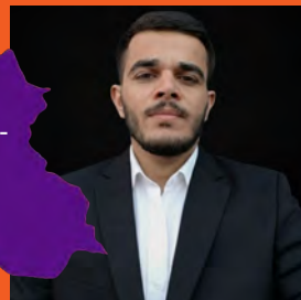
EIC - Iraq