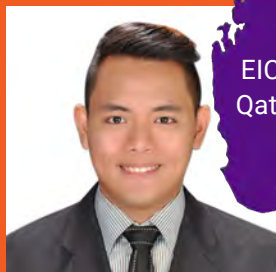
EIC - Qatar

E nergy International Corporation is continuing to grow. Please take a moment to welcome our new employees and celebrate with those who have work anniversaries and promotions. We thank you all for your dedication to making EIC a success.