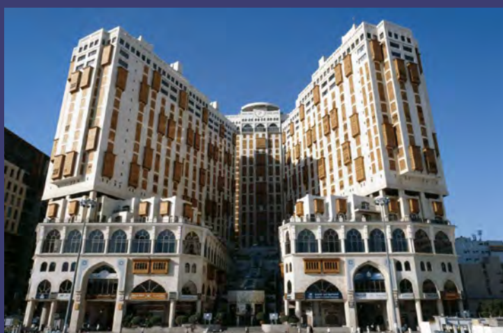
Makkah Hotel and Towers, Makkah