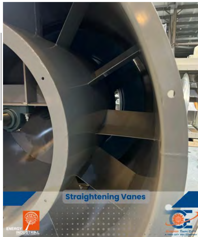
The QCLBSH, our Mixed Flow Smoke and Heat Exhaust Fan, built for critical smoke control applications where safety and precision matter most.

*Proudly made in the UAE, with Twin City Fan & Blower USA engineering heritage.