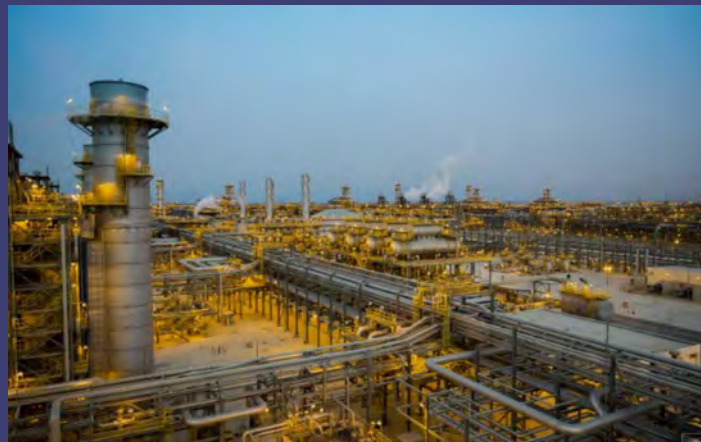
Udhailiya AC Plant